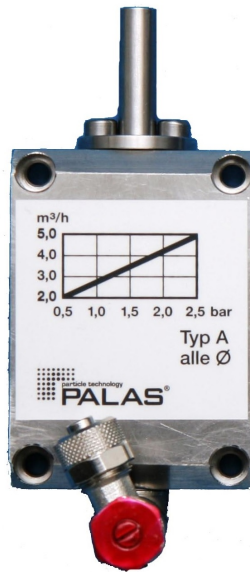
Fig. 3: Type A dispersing cover

Two different dispersing covers can be used for optimal dispersion (see Fig. 3, additional details under "Accessories"), including: Type A and type D.