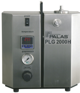
Heated version of the PLG 2000 (up to 100°C)