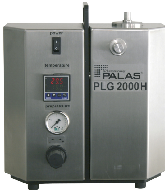
Fig. 1: PLG 2000 H

Unlike the PLG 2000, the PLG 2000 H is equipped with a built-in heating unit that can reach 100°C.