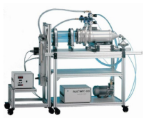
MMTC 2000 E Stainless steel version for temperatures up to 70°C