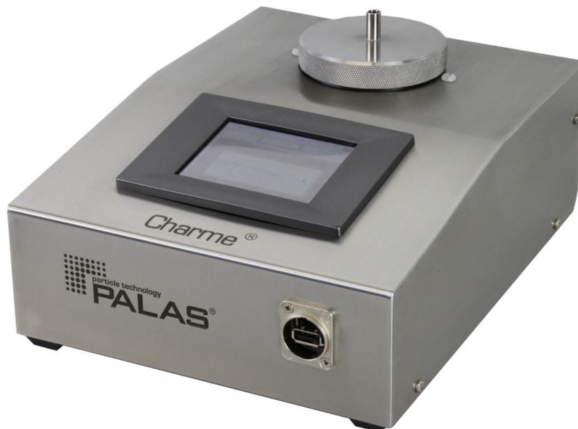
Fig. 1: Charme® reference aerosol electrometer

The Charme® charge aerosol measurement system developed by Palas® is a high-capacity Faraday cup aerosol electrometer that measures the electrical charges on aerosol particles.