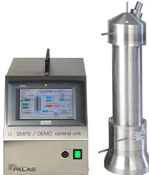
Fig. 1: DEMC 2000

The Palas® DEMC is available in two versions. The version with the long classifying column (2000 model) is able to classify particles in the size range of 8 to 1,400 nm.