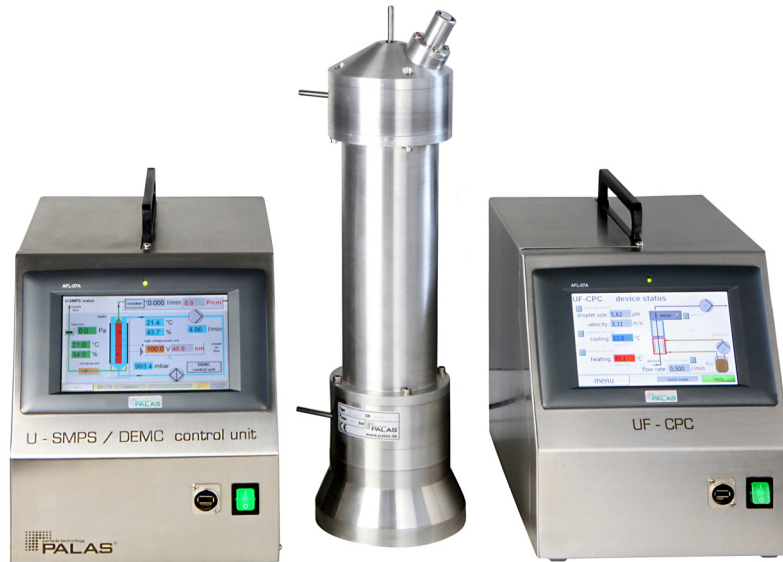
Fig. 1: U-SMPS 2050/2100/2200

The Palas® universal scanning mobility particle sizer (U-SMPS) is available in two versions. The long classifying column (2050/2100 model) is able to reliably determine particle size distributions of 8 to 1,200 nm. The Palas® U-SMPS system includes a classifier [defined in ISO 15900 as a differential electrical mobility classifier ( DEMC ) also known as a differential mobility analyzer (DMA)], in which aerosol particles are selected according to their electrical mobility and passed to the outlet.